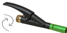
DISPENSING PISTOL WITH ROTATING CONNECTION