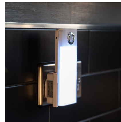
NiteSafe Duo Lux