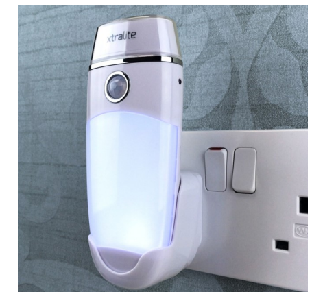
NiteSafe Duo +