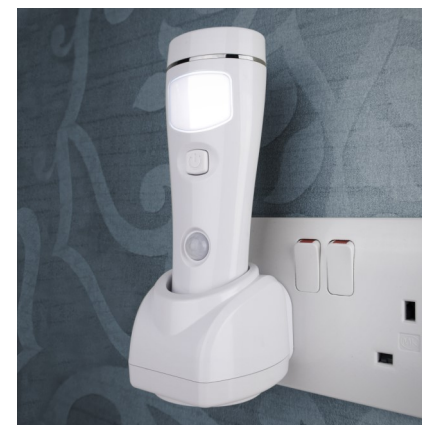
NiteSafe Duo +

Please get in touch for more details on each of our models