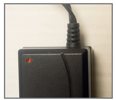
O . The indicator on the charger will illuminate red when charging and green when fully charged.