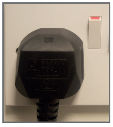
@ . Plug the charger into a suitable socket outlet. Turn switch on (UK sockets).