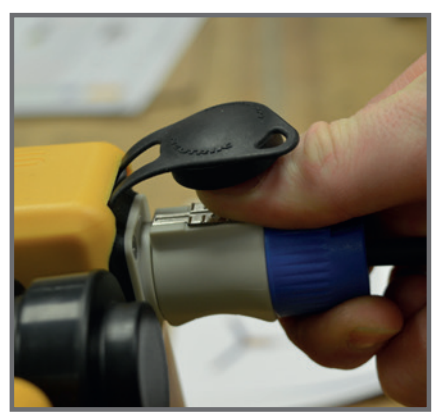
• Plug the charger into the socket on the Solaris Pro.