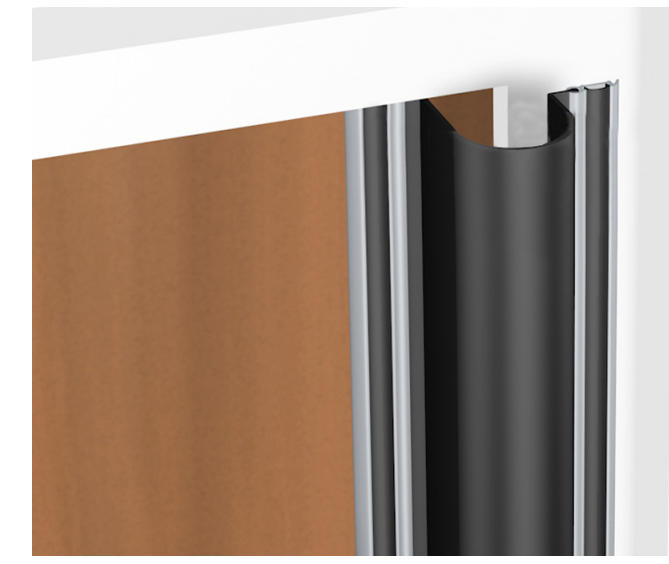
FingerKeeper Industrial - RP62 shown on a closed door