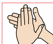
Palm to palm