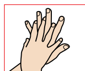
Back of hands